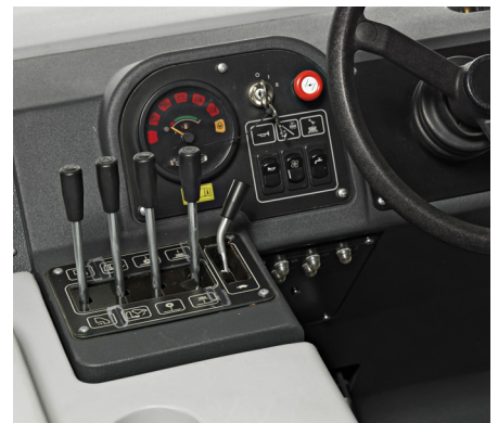
Easy to use operating controls mean more efficient cleaning